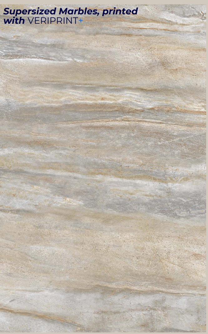
Supersized Marbles, printed with VERIPRINT+