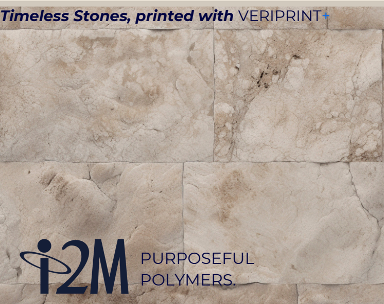
Timeless Stones, printed with VERIPRINT+

Introducing the highest definition rotogravure print in North America.