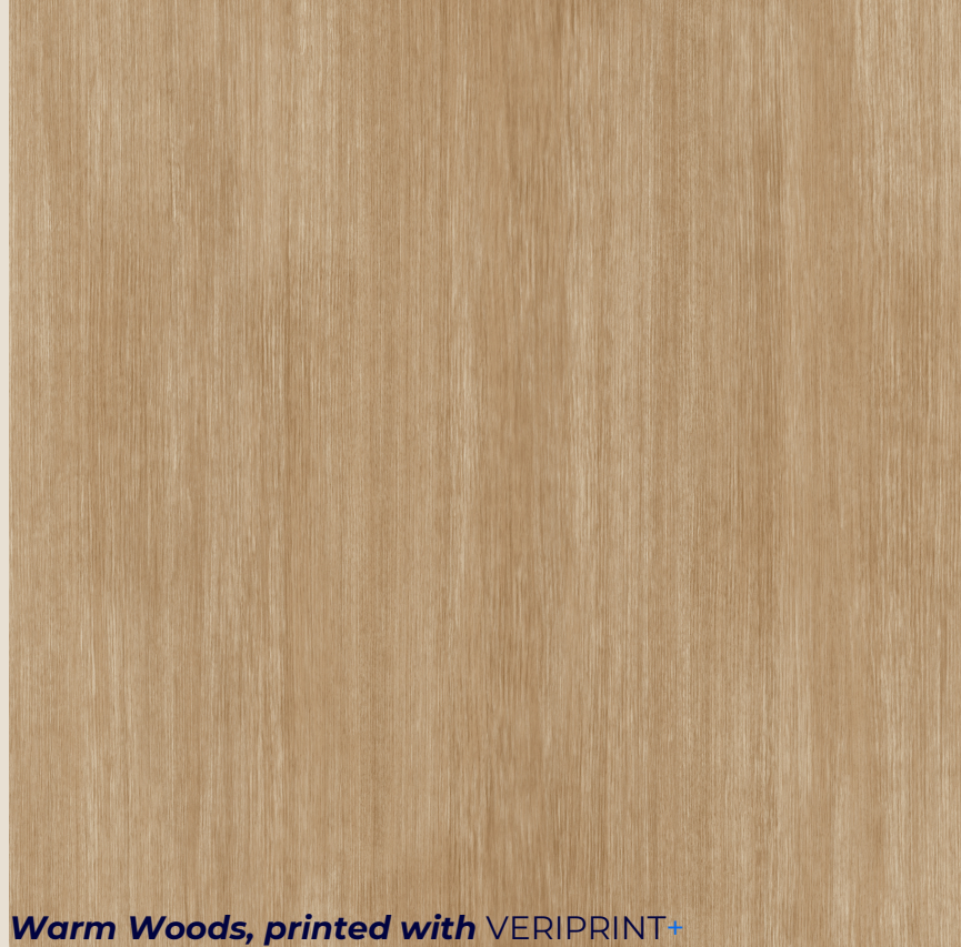
Warm Woods, printed with VERIPRINT+