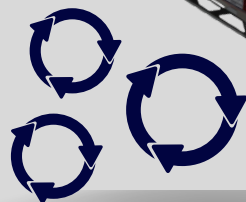
point-of-purchase made with ReNew™ DigiFlex